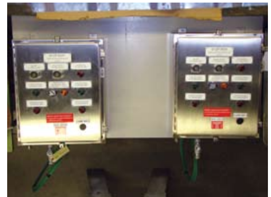
PLC termination and control boxes