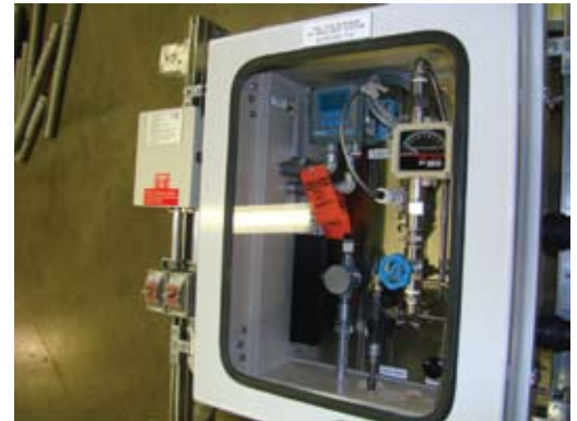
pH analyzer system

We look forward to discussing how this value-added service can benefit you.