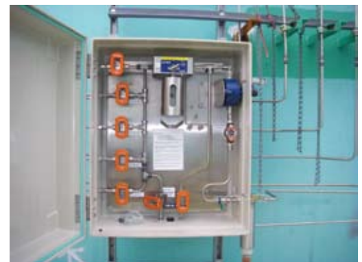
Winterized multi-level side-tank grab sample station